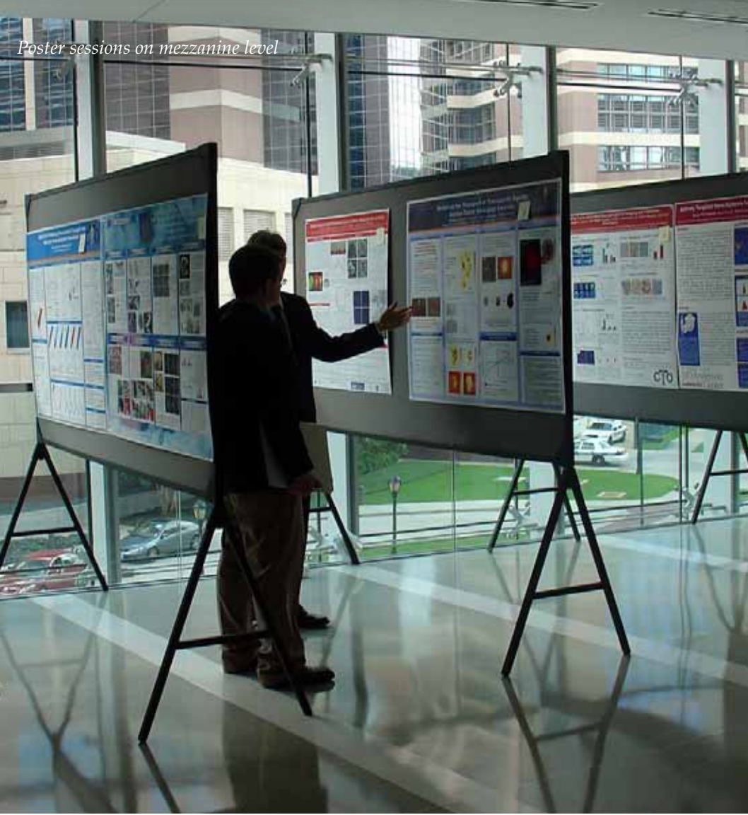
Poster sessions on mezzanine level

The auditorium has capacity for 267 people and a large mezzanine to accommodate poster presentations, receptions and breaks. The room is fully equipped with integrated videoconferencing, web broadcasting and recording equipment. Two large flat-panel screens also provide live feeds of auditorium proceedings to the mezzanine.