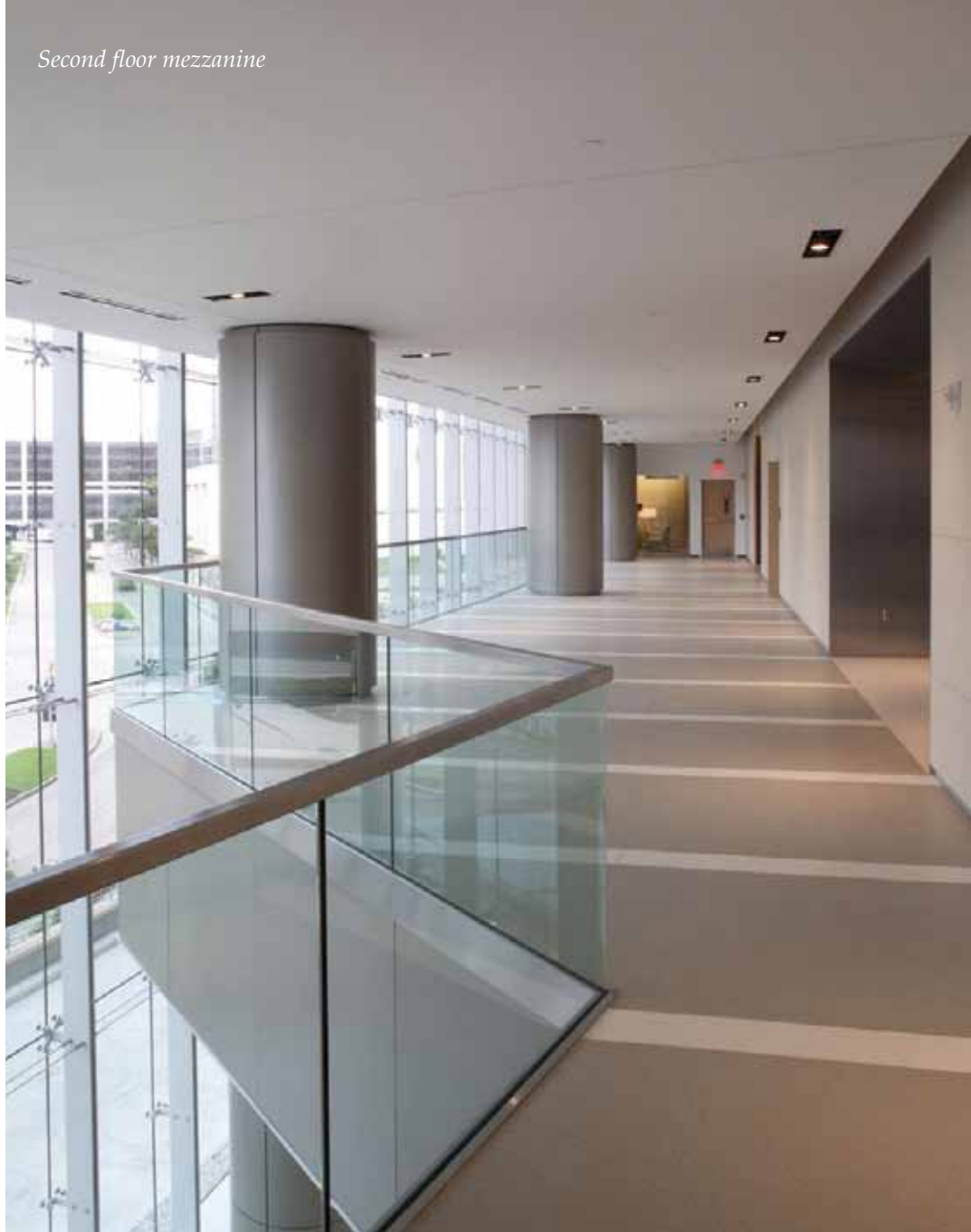
Second floor mezzanine